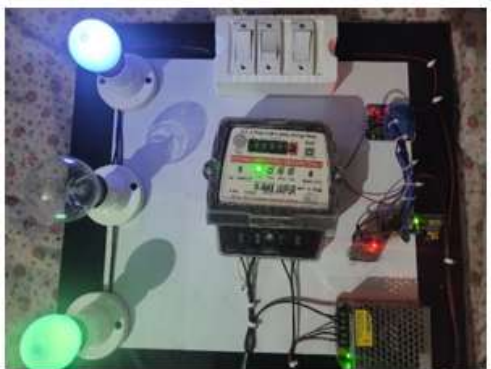
Fig. b Innovative Digital Energy meter.

Fig b Show the energy-saving experimental setup that was also used to measure