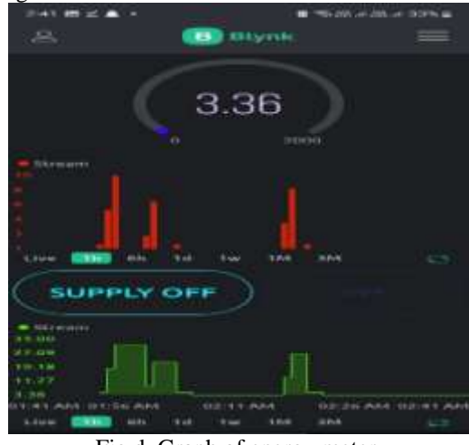
Fig d. Graph of energy meter

The above fig. c show the user's power consumption reading and bill which have to be paid by the user . Consumer also have rights to turn 'ON' or 'OFF' the meter supply using Blynk consoler applicationprovided the username and password by the MSEB as a admin. Turning off the Switch will enable us to conserve energy when no longer needed.