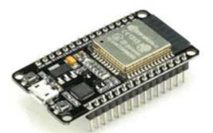
ESP32 is a low-powermicrocontroller having Wi-Fi and dual-mode Bluetooth, making it suitable for designing and prototyping IoT solutions.