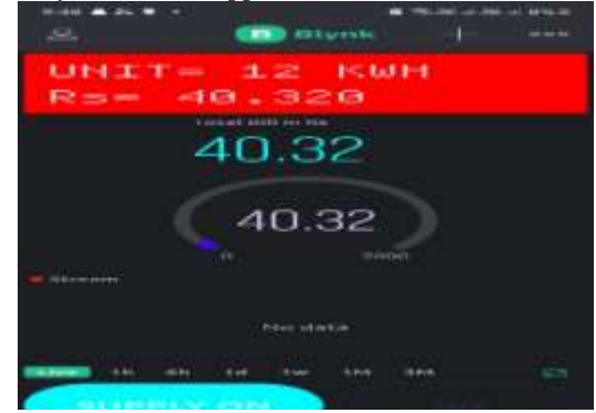
Fig c User login interface

the energy. The customer's house is equipped with an MSEB demand meter. The goal of this project was to show that the readings obtained from the three entities—MSEB, consumers, and reading staff—were identical. To maintain the reading, bill payment, and demand meter turn off, we are using the Blynk consoler application.